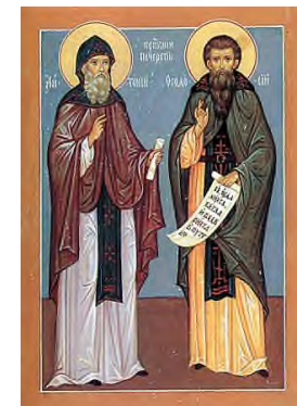
ПРЕПОДОБНІ АНТОНІЙ ТА ФЕОДОСІЙ КИЄВО-ПЕЧЕРСЬКІ VENERABLE ANTHONY & THEODOSIUS OF THE KYIVAN CAVES

Євангеліє (Gospel): Матфея (Matthew) 21:33-42