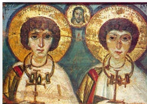
МЧЧ. СЕРГІЙ та ВАХ SS.SERGIIUS AND BACCHUS