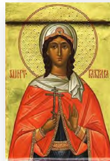
СВЯТА ВМЦ ВАРВАРА