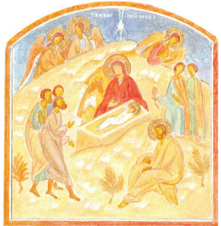
„Рождество Христово“ - справа от иконописця

These are simple examples of Icons that will be written in Cathedral when donors for the project can be found!