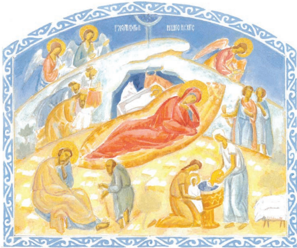
„Рождество Христово“ Вручані Богородиці (Великий розмір).