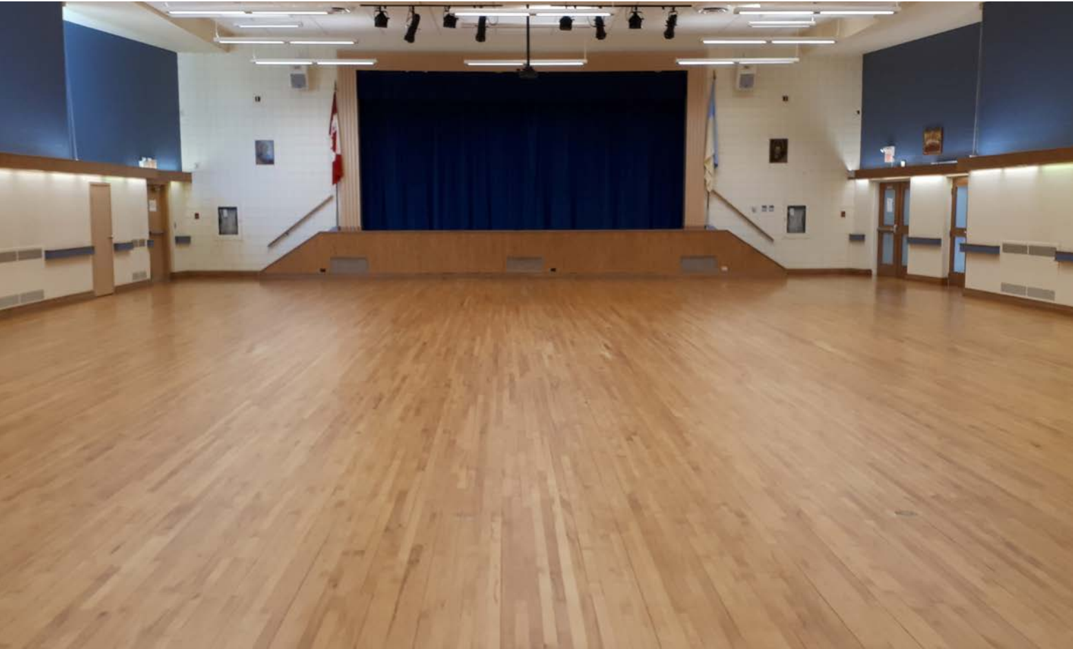
Refurbished Floor in Solarium